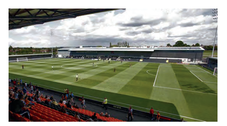
WHO PLAYS AT THE GROUND PICTURED?

5. Which club plays at the ground pictured?