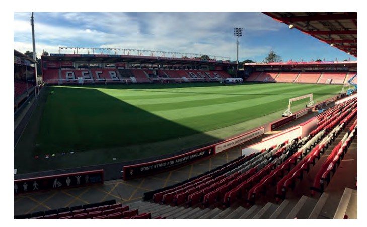
WHO PLAYS AT THE GROUND PICTURED?