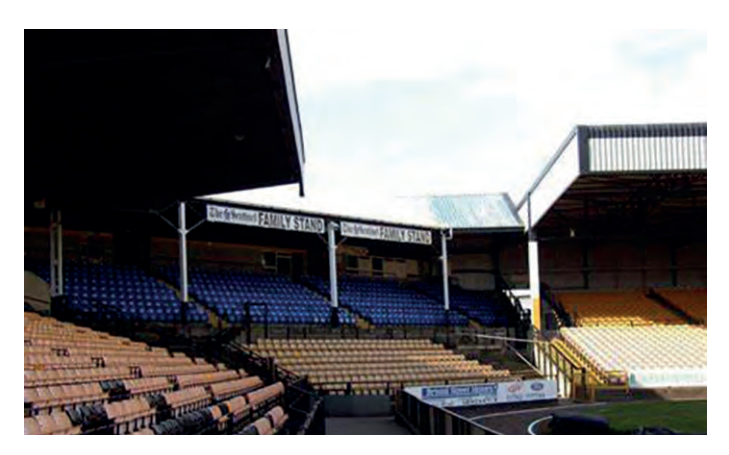
WHO PLAYS AT THE GROUND PICTURED?