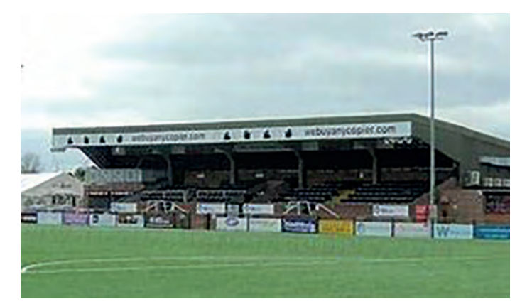
WHO PLAYS AT THE GROUND PICTURED?

5. Which club plays at the ground pictured?