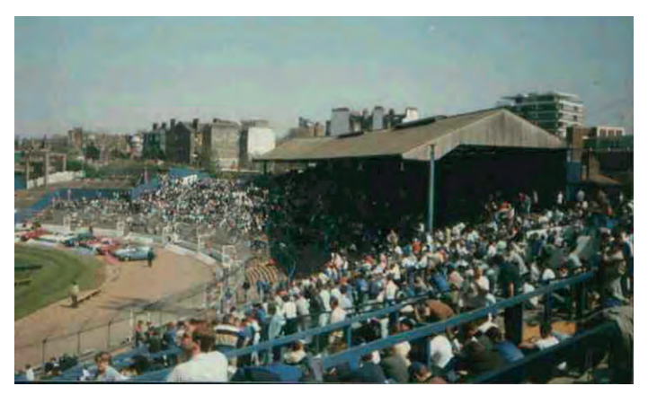
WHO PLAYS AT THE GROUND PICTURED?

5. Which club plays at the ground pictured?