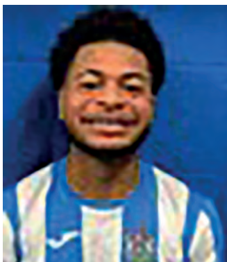
MOHAMMED ALI Please Sponsor Me