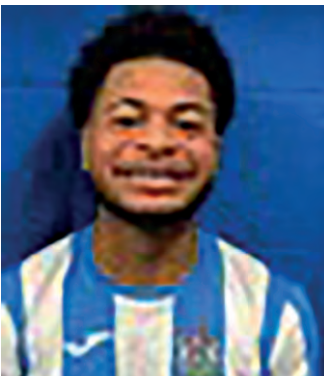
MOHAMMED ALI Please Sponsor Me