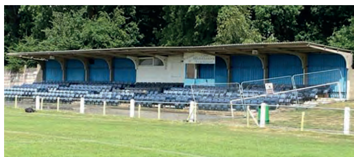
Middlesex Stadium Breakspear Road Ruislip HA4 7SB

Take the B467 towards Uxbridge/Harefield/Ickenham. At Swakeleys Roundabout take the third exit to stay on B467 and take 2nd exit at next roundabout to stay on B467. At the next roundabout take the first exit on to Breakspear Road South. After 1.2 miles turn right on to Breakspear Road and after 0.6 miles turn left to reach destination.