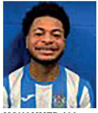
MOHAMMED ALI Please Sponsor Me