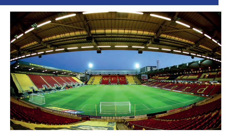
WHO PLAYS AT THE GROUND PICTURED?