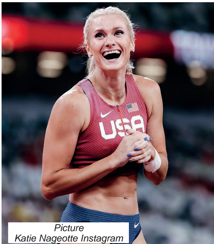
Picture Katie Nageotte Instagram