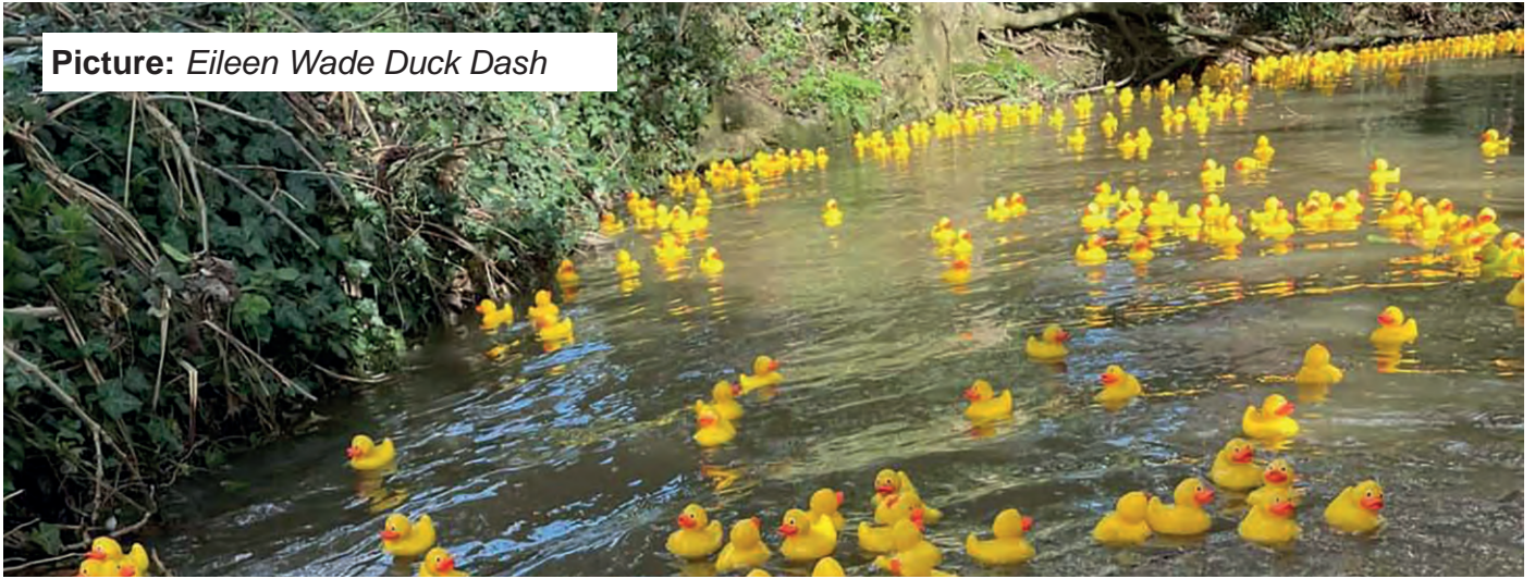
Duck Dash