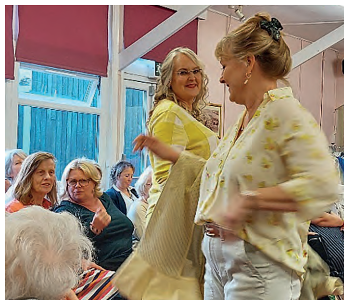
MILTON ERNEST FASHION SHOW MAY 2023