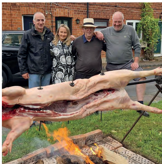
SOULDROP PIG ROAST JULY 2023