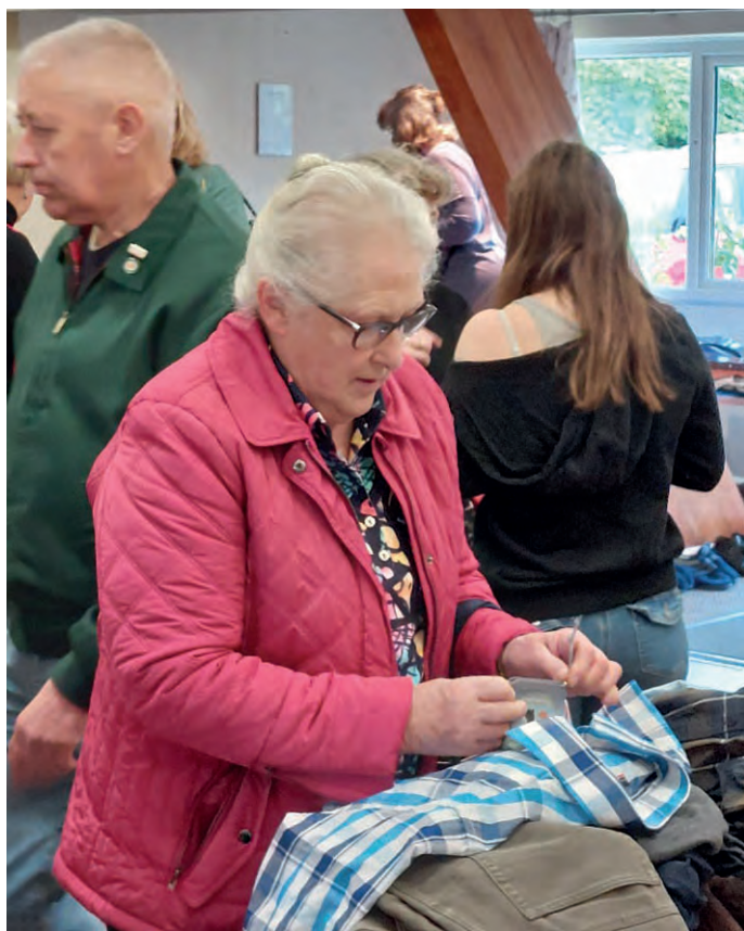
KEYSOE JUMBLE SALE MAY 2023